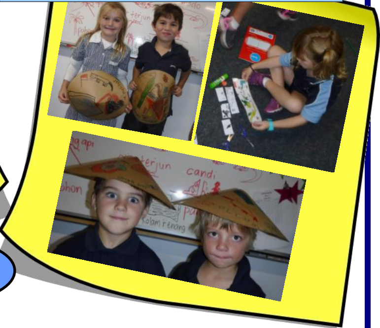
The F-1 class has been looking at things you may see in Indonesia and discussing whether they are also in Australia.