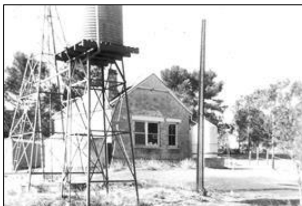
Lake Wangary School 1972

The 1980 Year 5-7 children wrote a book called "The School We Won't Forget". This book can be borrowed from the school library.