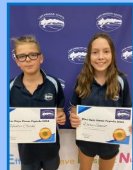
Blue Rays Hunter Clarke Darci Sunset