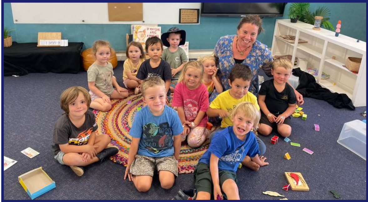
What a great bunch of little people in our Preschool Class!