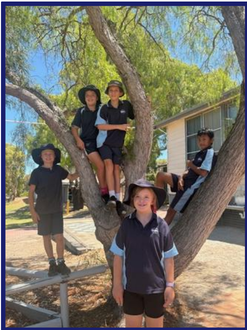
Students having fun at lunchtime playing tennis, soccer, climbing trees and just chatting!